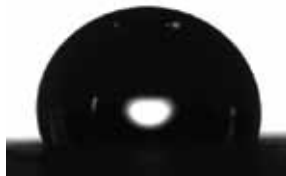
SurfaPore F treated carton

Water contact angle on untreated sample on the left (absorption) and beading effect on SurfaPore F treated sample on the right.