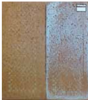
Ceramic bricks with and without SurfaPore R after immersion in saltwater for 24 hours

Water Vapor Transmission of materials (ASTM E96): Water Vapor transmission loss was determined as the rate of water vapors pass through a 2cm thick ceramic sample. Vapor Permeability Loss: 4.94% (surface application).